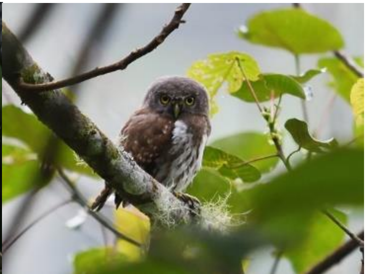
Sunda Collared Owlet