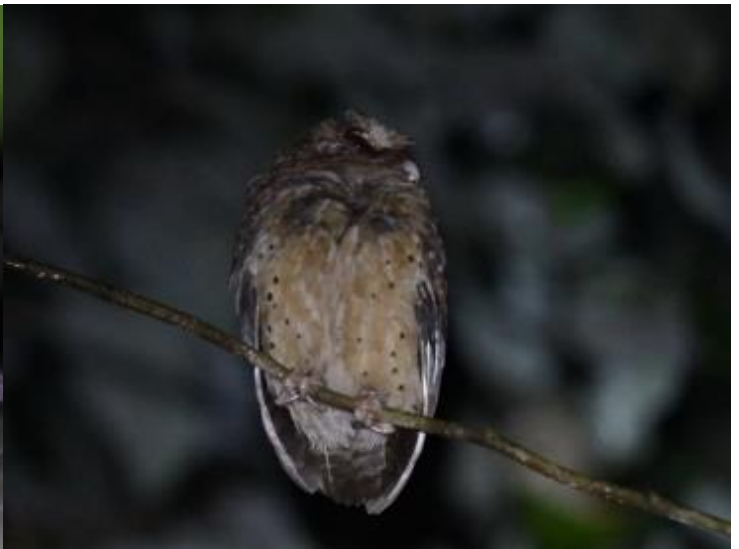
Reddish Scops Owl