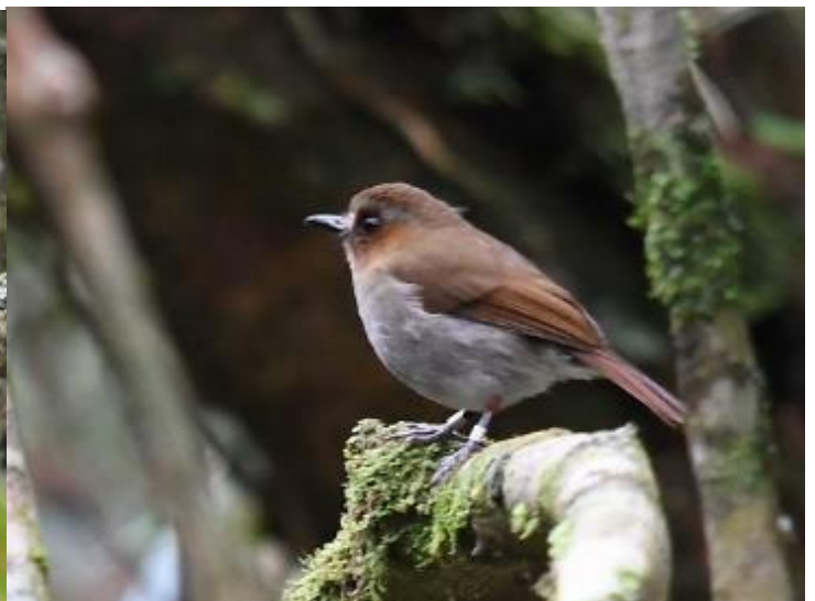
Eyebrowed Jungle Flycatcher