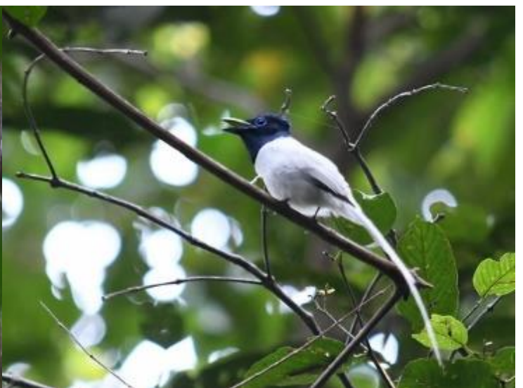
Blyth's Paradise Flycatcher