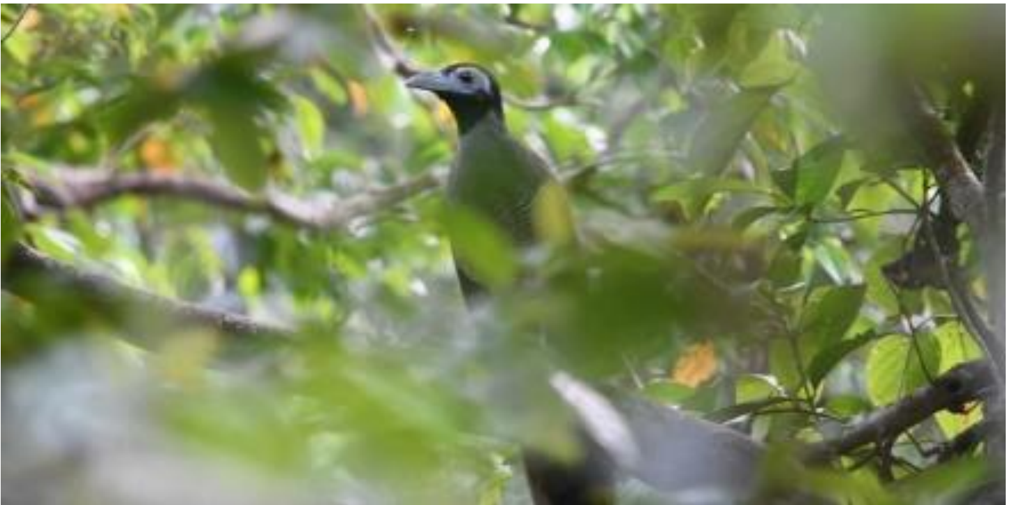
Bornean Ground Cuckoo