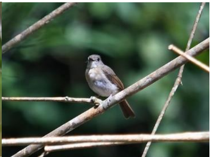
Fulvous-chested Jungle Flycatcher