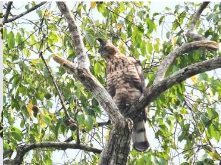
Wallace's Hawk Eagle