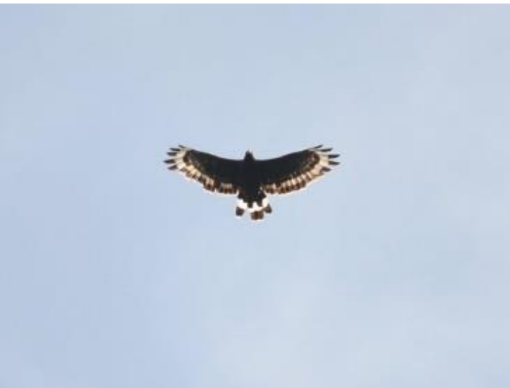
Mountain Serpent Eagle