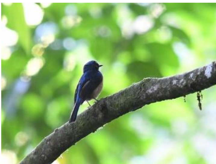
Bornean Blue Flycatcher