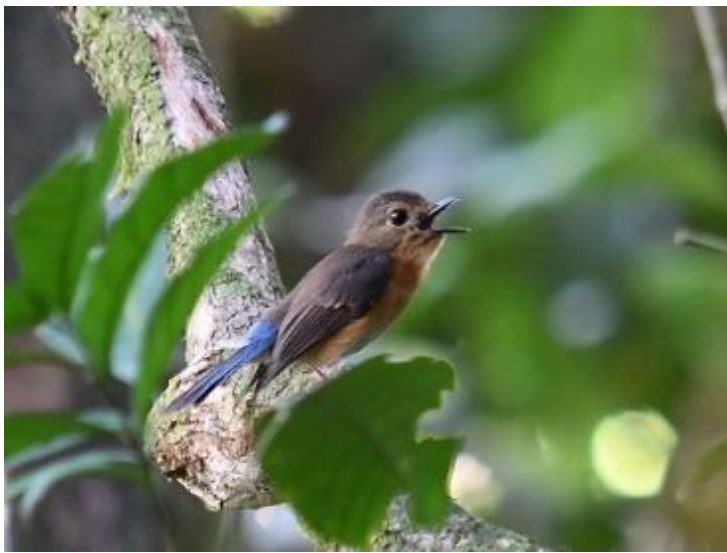
Sunda Blue Flycatcher