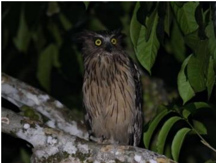
Buffy Fish Owl