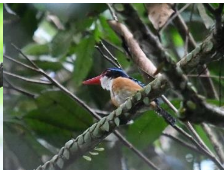
Bornean Banded Kingfisher