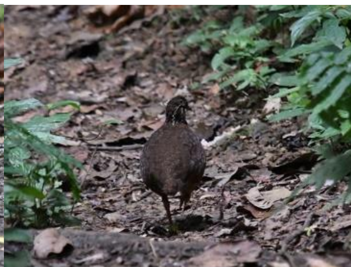
Sabah (Chestnut-necklaced) Partridge