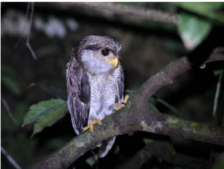
Barred Eagle Owl