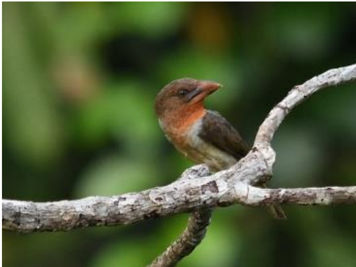
Bornean Brown Barbet