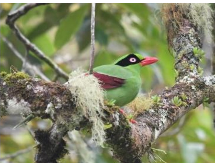
Bornean Green Magpie