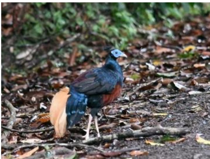
Bornean Crested Fireback