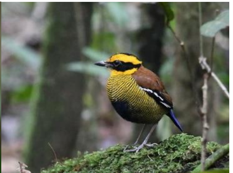
Bornean Banded Pitta