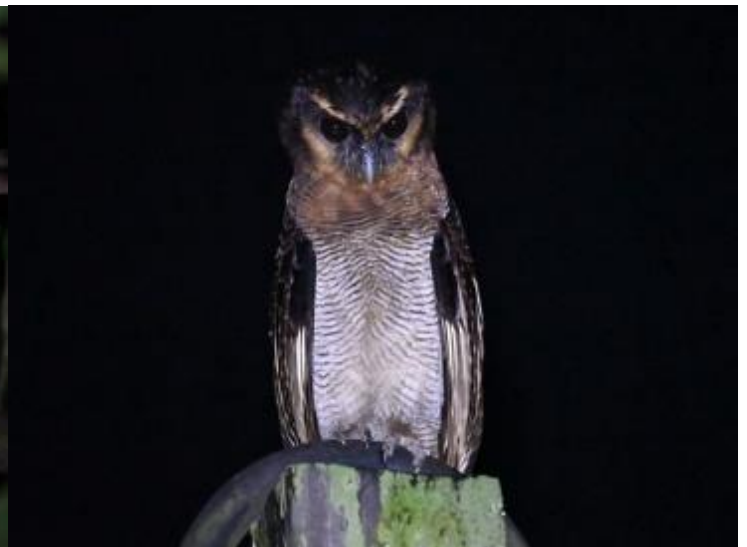
Brown Wood Owl