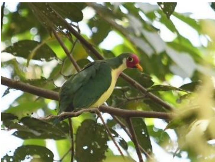
Jambu Fruit Dove